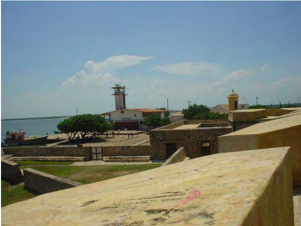
Castillo San Carlos de Maracaibo

Morning flight from Caracas to Maracaibo. Visit the city market of Maracaibo and the Basilica de la Chinita church or take an afternoon excursion to Fort Maracaibo and the dunes at the mouth of Maracaibo Lake. Overnight at local hotel **** (L)