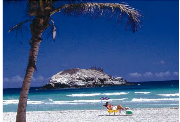
Living la vida local!

A short plane hop brings you to Margarita Island, 414 sq. miles of mountains, deserts, rivers, lakes, and fine beaches. You are transferred to your comfortable posada. Typical posada (B)