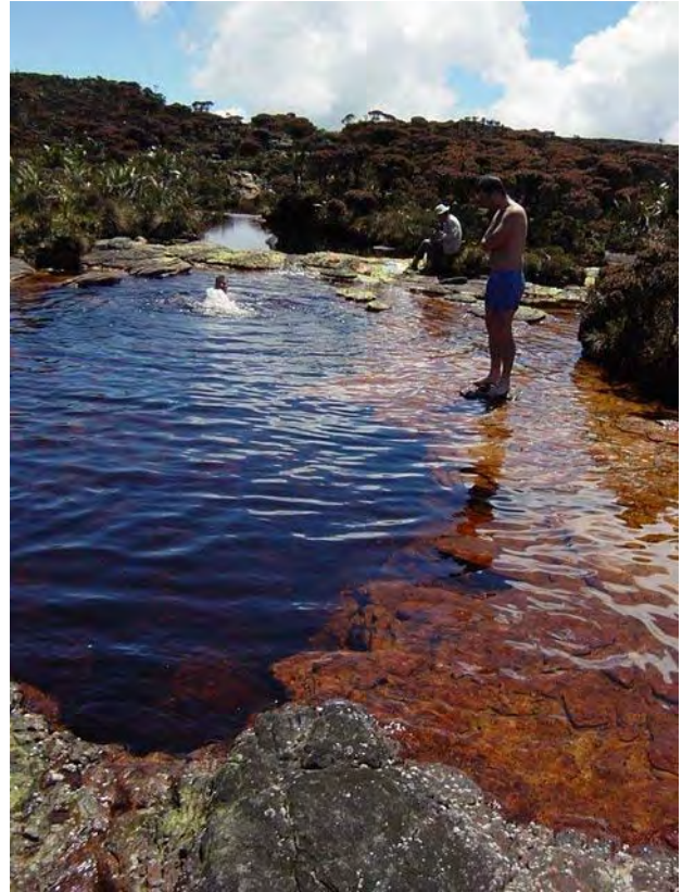
Natural hot springs

Trek for a couple of hours to reach the peak of Pan De Azúcar at an altitude of 4,600 mtrs. - thin air at this altitude is normal. Weather permitting we'll view Sierra Nevada's highest peaks, Bolívar and Humboldt as well as the northern side of the Maracaibo basin. Hiking through a desert-like landscape to reach the second campsite at the edge of 3 mountain lakes. (6-8 hours walking). (B, L, D)