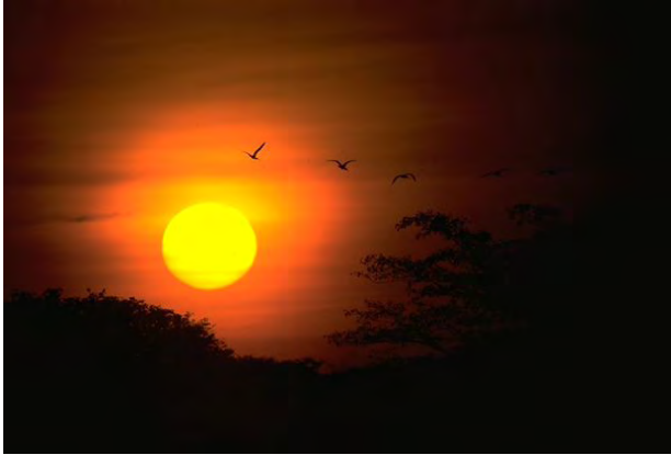
Los Llanos sunset

Take a bus from Mérida to Los Llanos - an adventure in itself. Passing through the Venezuelan highlands your driver will stop in Andean towns and the beautiful Sierra Nevada National Park. Visit the local cocoa and coffee farms located on the foothills of the Andean rainforest. When you arrive at the camp, located near Guaritico wildlife sanctuary, you will be given a candlelight dinner. Overnight in hammocks – listen to the sounds of the Llanos. (B, L, D)