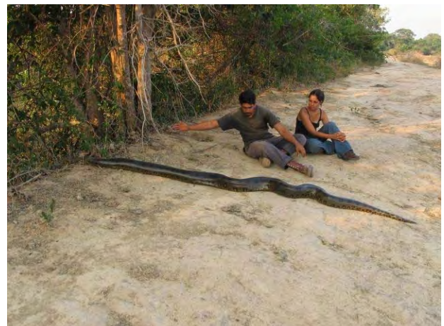
Anaconda up close and personal

Jeep excursions in the dry season and boat outings in the wet months (roughly May to November) offer possible sightings of crocodiles, giant anteaters, iguanas, capybaras, monkeys, tapir, deer, giant river otters, caiman, anacondas, and hundreds of species of exotic tropical birds. At the lodge, enjoy nature presentations, a swim in the pool and evening of "joropo" folk music. Hato El Cedral or similar (B, L, D)