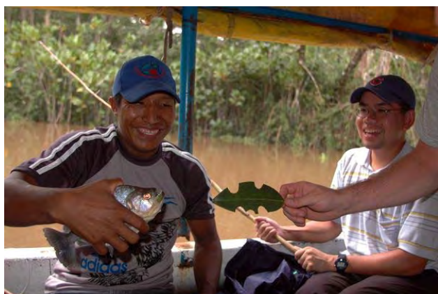
Warao guide - Piranha fishing

Navigate the Orinoco in search of river dolphins, spectacled caiman, capuchin and red howler monkeys by the rivers edge, hummingbirds, scarlet ibis, toucans, parrots, macaws and kingfishers in the skies above. Visit Warao villages and their palafitos that line the riverbanks. Your guide will explain about Warao culture, and the flow of the community's daily life. Meet some of the Warao craftsmen / women and negotiate for their handcrafts. Typical lodge (B, L, D)