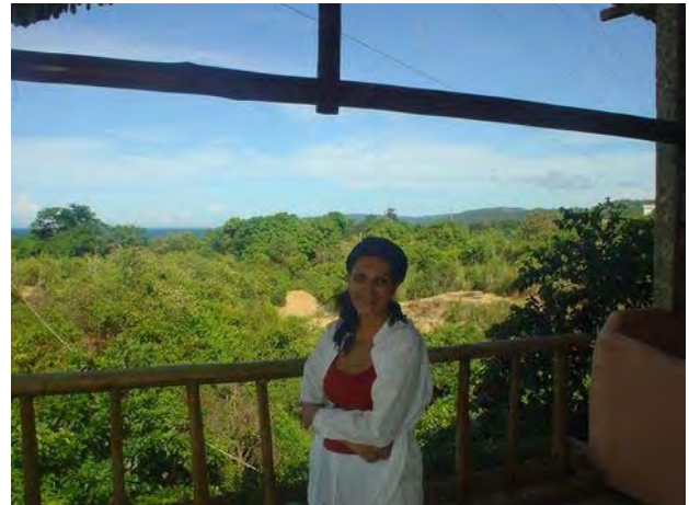
Beatrice of Aloe Spa awaits your visit

Additional treatments available by request. Optional mini tours from the lodge – swimming, snorkeling, fishing, trekking, hiking, etc. Aloe Spa (B, L, D)