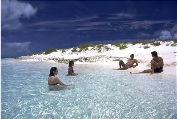
Pristine beaches of Los Roques

Fly to the Archipelago of Los Roques, a blue and white mosaic of sandy isles, warm, clear waters, and coral reefs teeming with colorful fish. Transfer to your small posada for an afternoon of swimming and snorkeling. Typical posada (L, D)