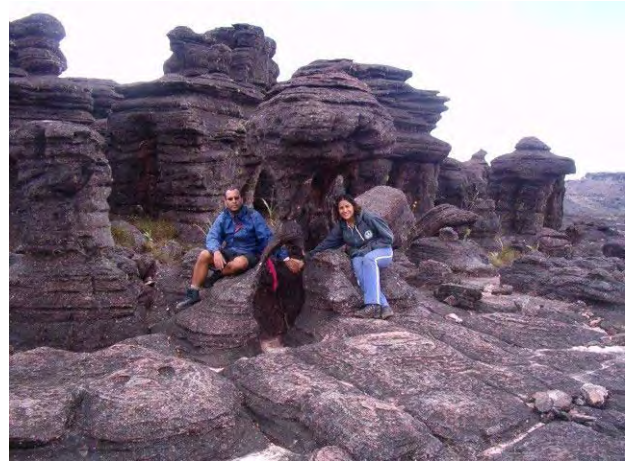
Strange rock formations

The plateau of Roraima is around 70 sq kms with strange formed rock formations, bizarre flesh eating endemic plants (drosseras) and black dinosaur looking frogs. Explore this labyrinth of black lichen tainted rocks and hike for the whole day. Reach the valley of crystals, the obelisk monument of Triple Point (border of Venezuela – Brazil - Guyana) - no passport required. Hike to "El Pozo", a natural water hole with a small cave system beneath. Truly fantastic - around 8 hours of walking and exploration on the plateau. (B, L, D)