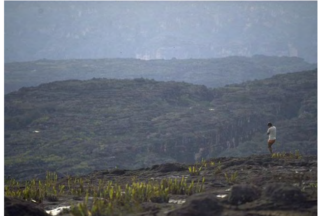
The vastness of Auyántepeui

Explore the surroundings of El Oso. Hike across huge slabs downhill to a tributary of the river Churún, where you may take a refreshing bath in the cool clear water. Continuing the exploration across the slabs one will see different type of endemic vegetation, mosses, cacti and orchids etc. (B, L, D)