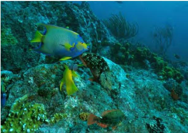
Queen and Spotlight Fish

Spend the day exploring one of the richest marine habitats in the Caribbean, with snorkeling and the option of diving in various unique settings. Take an optional side trip to the islands of Dos Mosquises and visit the turtle conservation centre. Typical posada (B, L, D)