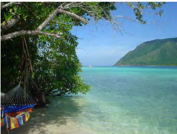
La Cienaga Lagoon

Visit the spectacular saltwater lagoon of La Cienaga surrounded on three sides by mountainous rainforest. Swim, snorkel, kayak and explore the mangroves, tiny beaches and explore our nature trails behind the mangroves in the xerophytic rain forest where it is possible to see monkeys, deer, wild pigs and tracks of larger animals. Learn about the importance of mangroves in our ecosystem. Dive (optional) the many different locations in and around the lagoon - including two sunken "ships" close by. Coral Lagoon Lodge - La Cienaga (B, L, D)