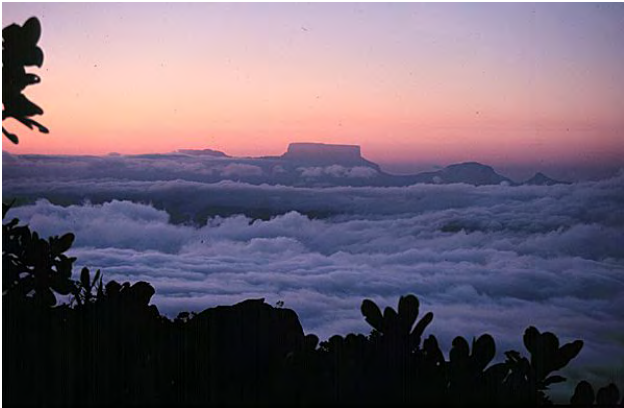
"Islands in time" – National Geographic May 1989

Waking alongside a thick and lush belt of humid cloud forest we trek for about 2 hrs through this thick and beautiful jungle with many neo tropical plants such as bromeliads, tree ferns and heliconas. After another 2 hours of ascent along a path with big rocks we reach the top of the plateau, seems like we landed on the moon! Lunch followed by an exploration of the strange surroundings on this "island in time". (B, L, D)