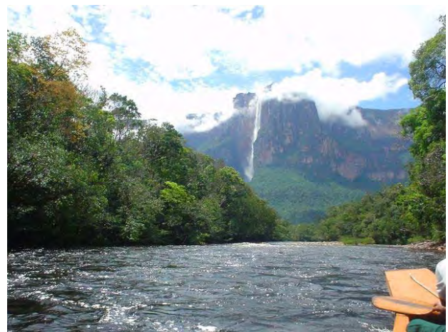
Angel Falls approach (Rio Churún)

Return to Canaima and fly back to Caracas. (B)