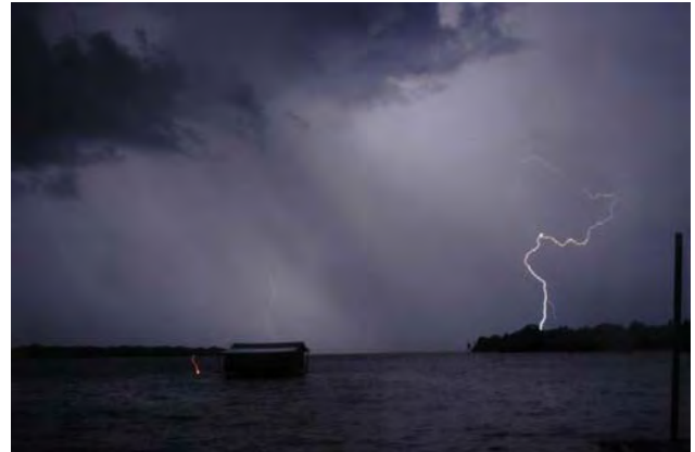
Catatumbo lightning phenomenon

Visit old sugar cane factories on the way to Lagunillas. See how “Chimo” paste is prepared and visit coffee and cocoa plantations in the foothills of the Andes. From the Maracaibo basin, embark on a fishing boat to visit mangroves, swamps, gallery forests and open lake to observe wildlife such as freshwater grey dolphins, iguanas, flocks of colourful birds and red howler monkeys. Overnight out on the lake in a stilted house known as a “Palafito” (hammocks). Keep one eye open all night to experience the phenomena of the Catatumbo lightning, replenishing the ozone layer! (L, D)