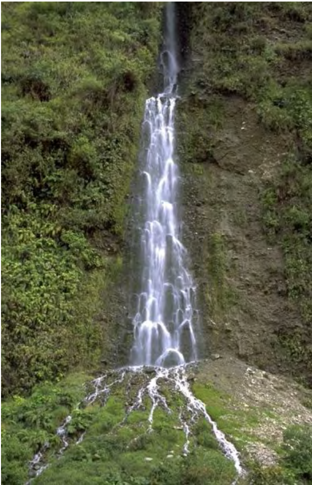
Local waterfall - Mérida

Leave Mérida driving up through El Valle to La Culata, the departure point of our hike, which lies at 2,950 mtrs. Walk for 3-4 hours to reach our first campsite at the foot of a waterfall in the middle of a mystic valley full of speletia flowers (3,600 mtrs). (L, D)