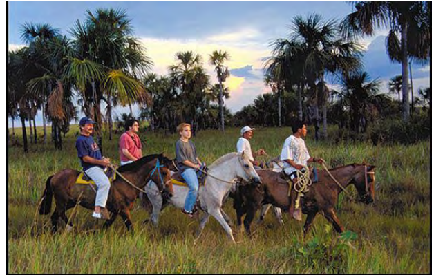
Horseback riding in the Llanos

Fly to Venezuela's premier wildlife region, Los Llanos, where an outstanding diversity of animals is easy to spot in the vast wet lands. Transfer from Barinas to your cabin at one of the finest hato ranches in the land. Then set out to explore the special beauty of the surrounding wilderness. Hato El Cedral or similar (L, D)