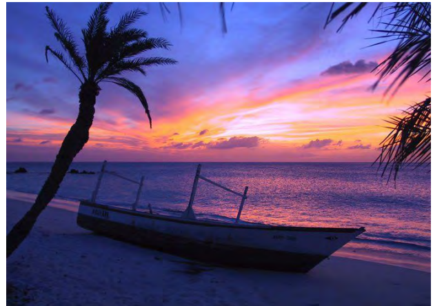
Margarita Island sunset

A jeep and boat excursion explores the island's wild side, from mangroves to the central Sierra and Macanao Peninsula. The rest of your stay is at leisure to enjoy your posada's facilities, pool or beach beckons. Typical posada (B)