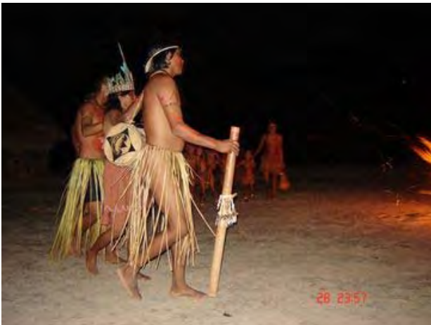
Pemón ritual dance

Transfer to the airstrip and fly back to Caracas. (B)