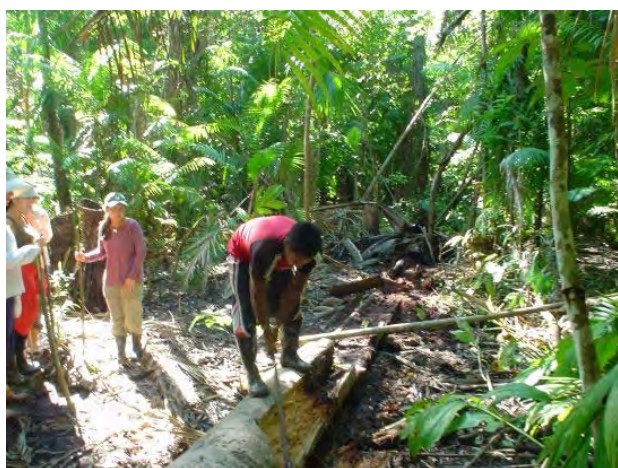
Warao guide hunting for "food" in jungle

We start our expedition in Maturín or Ciudad Bolívar traveling by road and then by river to the lodge in the Delta. From the comfort of your water-taxi you may observe a wide variety of flora and fauna, such as the boral (a river plant), pink dolphins, giant river otters, toucans, macaws, parrots, llanos sideneck turtles and even occasionally one may see an anaconda. Along the riverbanks you will see Indian villages with their unique raised dwellings (palafitos), built over the river's edge. Experience the wild, natural habitat of the virgin jungle, your Warao guide will point out edible plants which sustain the natives on hunting trips. Take a swim in the river by the camp and later enjoy one of the fabulous delta sunsets. Typical lodge (L, D)