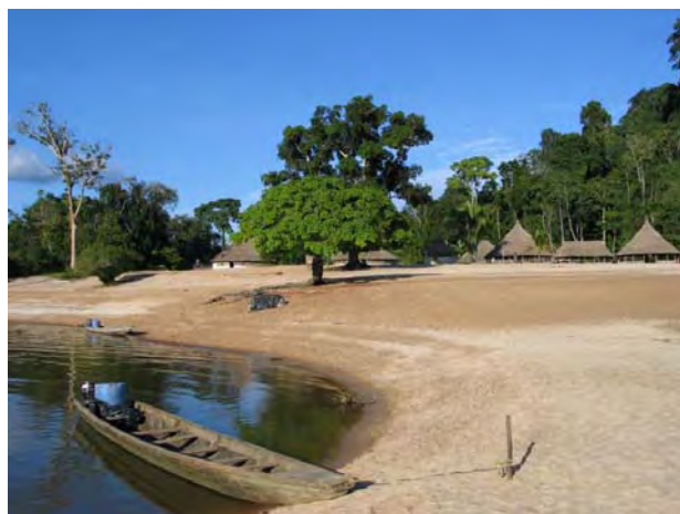
Campamento Yokore on the Caura River

Wake up to the sounds of the jungle and continue the expedition with a long hike, deep into the jungle towards the banks of the Rio Caura. Many natural observation points are made up with the formation of the famous rocks in and around Rio Caura. Enjoy the richness of the Guyanese jungle along the way with its diversity of flora and fauna. Continue the adventure from Rio Caura to the next lodging - Campamento Yokore. (B, L, D)