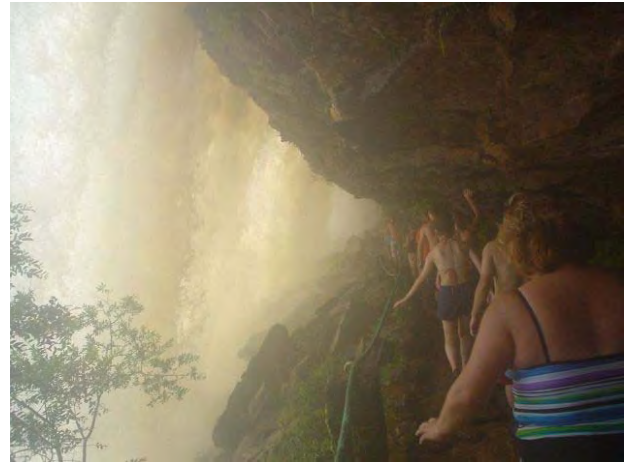
The wrath of Sapo Falls, Canaima

Fly to the jungles of Canaima, dotted by lagoons and soaring waterfalls pouring over the sheer cliffs of flattop tepuis. You are transferred to your lodge for a day of canoeing and exploring, with a hike to the thundering Sapo Falls. Rustic (budget) – standard - superior accommodations available (L,D)