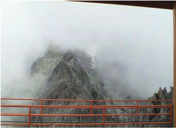
View from last station of the Teleférico

Head to the famed Teleférico cable car for a thrilling, 10,000-foot ascent in four stages to the summit of Pico Espejo. Take in the glorious vistas and hike the trails before descending to Mérida for an afternoon city tour. Prado Rio or similar (B, L, D)