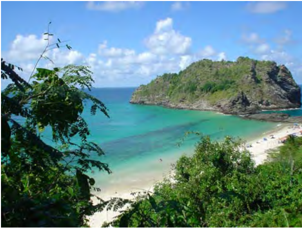
Deserted beach of Catica - even on weekends!

A scenic 3 hr drive from Caracas with the last 1 1/2 hrs driving up high into the clouded rainforest of Henri Pittier (Venezuela's first National Park). Arrive to where the "rainforest meets the sea" one can enjoy the local beaches of Cata and Catica if you arrive early enough in the day. The secluded beaches are often deserted mid week, except for the local vendors of fresh fish, local seafood and refreshing Caribbean cocktails. Enjoy the accommodations of two different ecolodges during your stay. On the mainland cycles are available to do your own self-exploration. De La Costa Ecolodge (L, D)