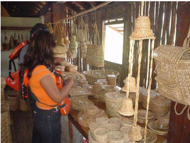
Indigenous handcrafts – Sinamaica Lagoon

Early morning excursion to Sinamaica lagoon, visit the local indigenous Indians, the Añu – Paraujana, in their stilted houses (palafitos) and a souvenir store full of their local indigenous handcrafts. Overnight in Maracaibo. (B, L, D)